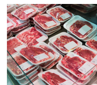
MEATS & SEAFOOD