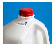
DAIRY & EGGS